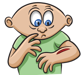
Infections or injuries heal more slowly than usual

For more information, visit Cornerstones4Care.com