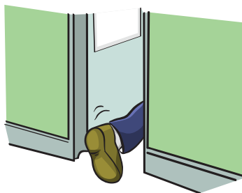
Needing to pass urine more than usual